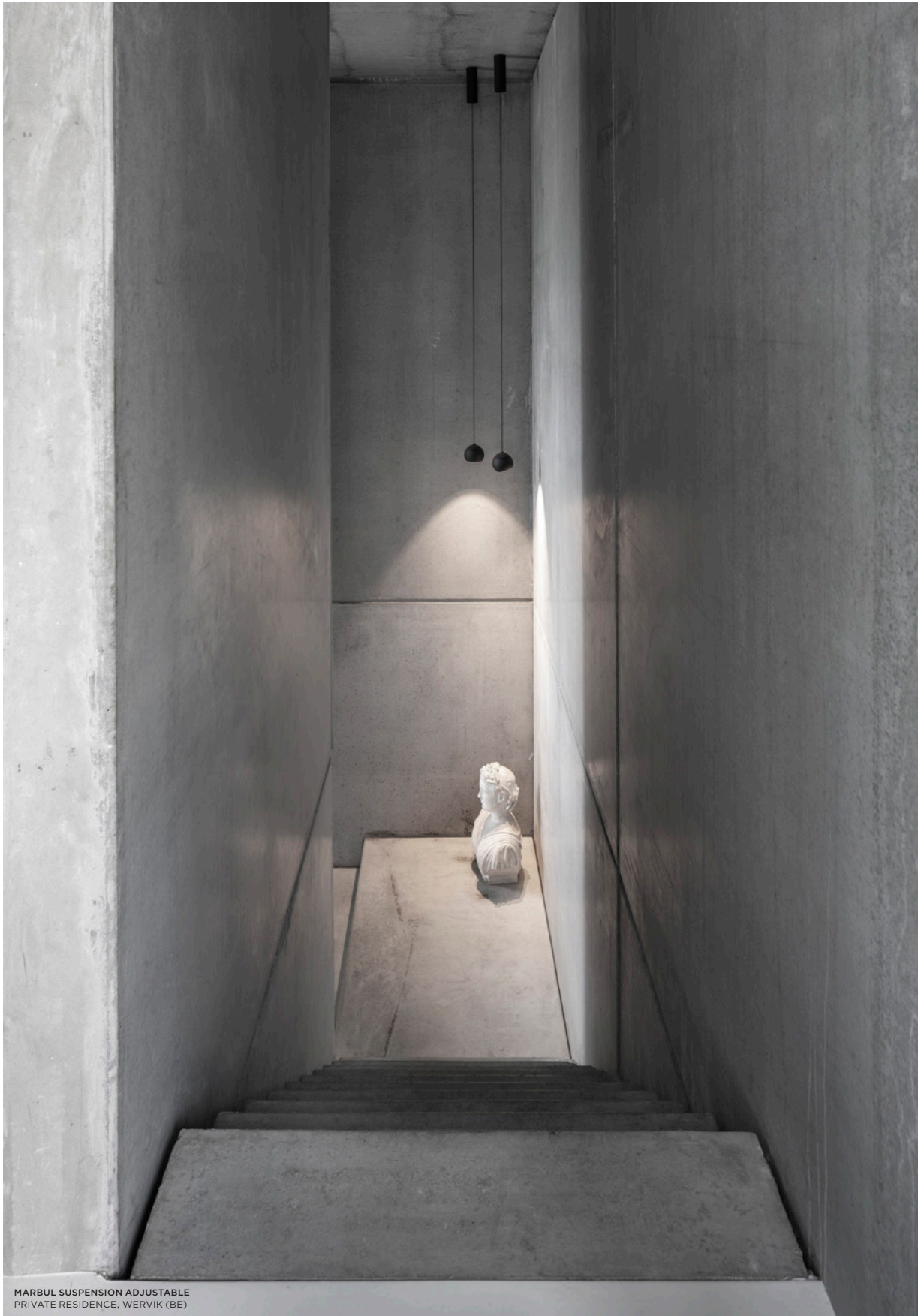
MARBUL SUSPENSION ADJUSTABLE PRIVATE RESIDENCE, WERVIK (BE)