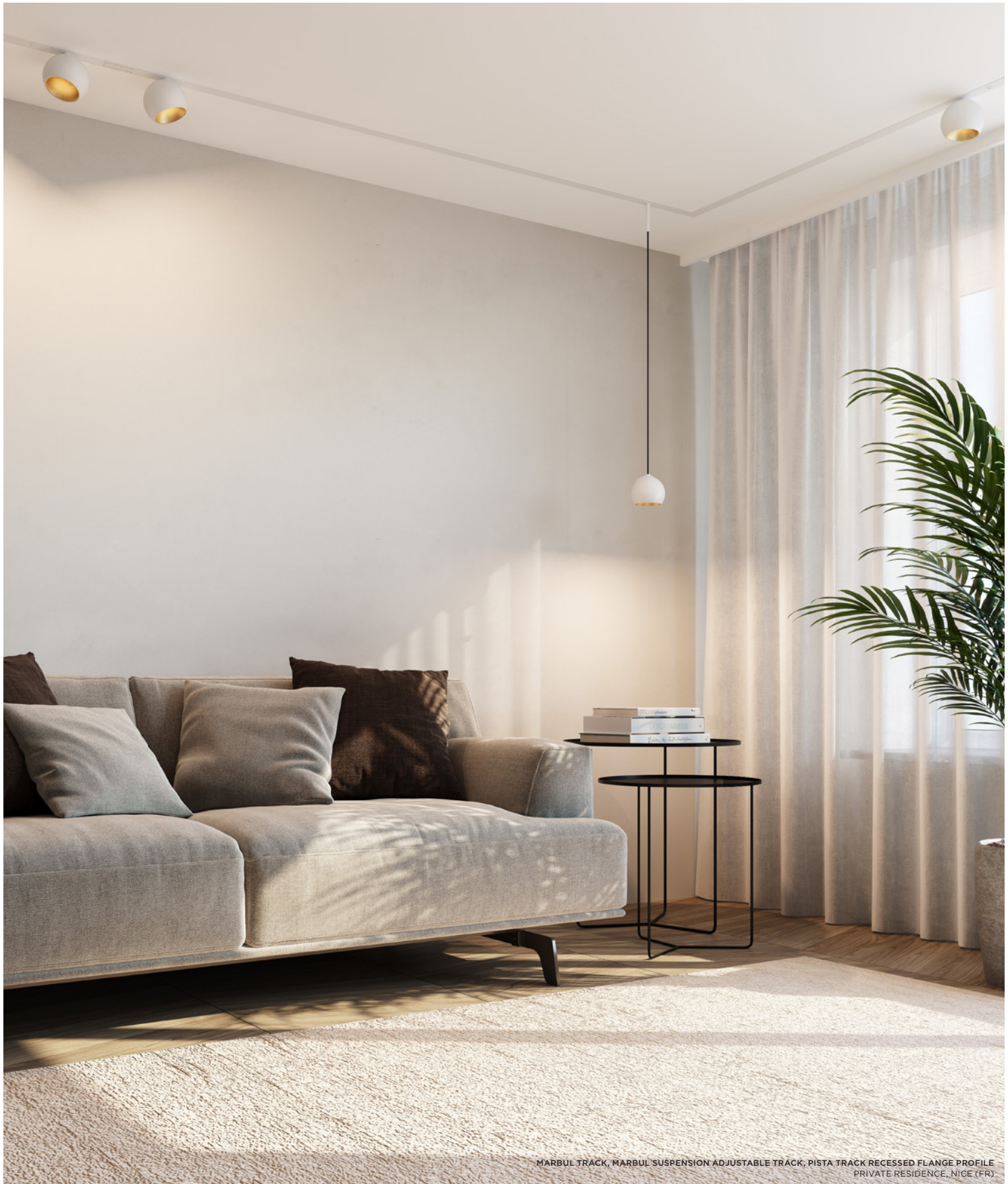
MARBUL TRACK, MARBUL SUSPENSION ADJUSTABLE TRACK, PISTA TRACK RECESSED FLANGE PROFILE PRIVATE RESIDENCE, NICE (FR)