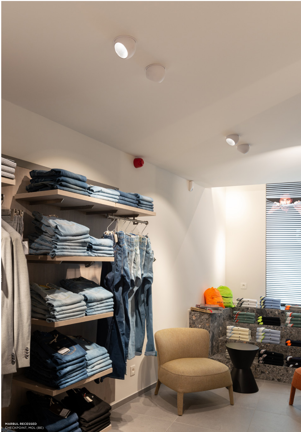
MARBUL RECESSED CHECKPOINT, MOL (BE)