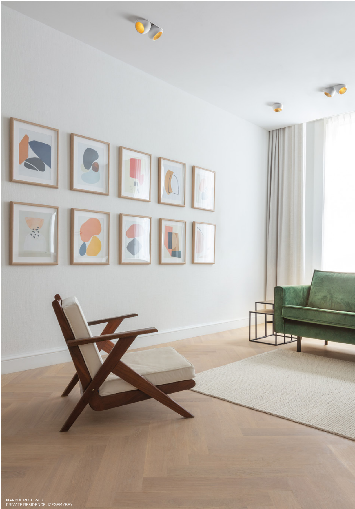
MARBUL RECESSED PRIVATE RESIDENCE, IZEGEM (BE)