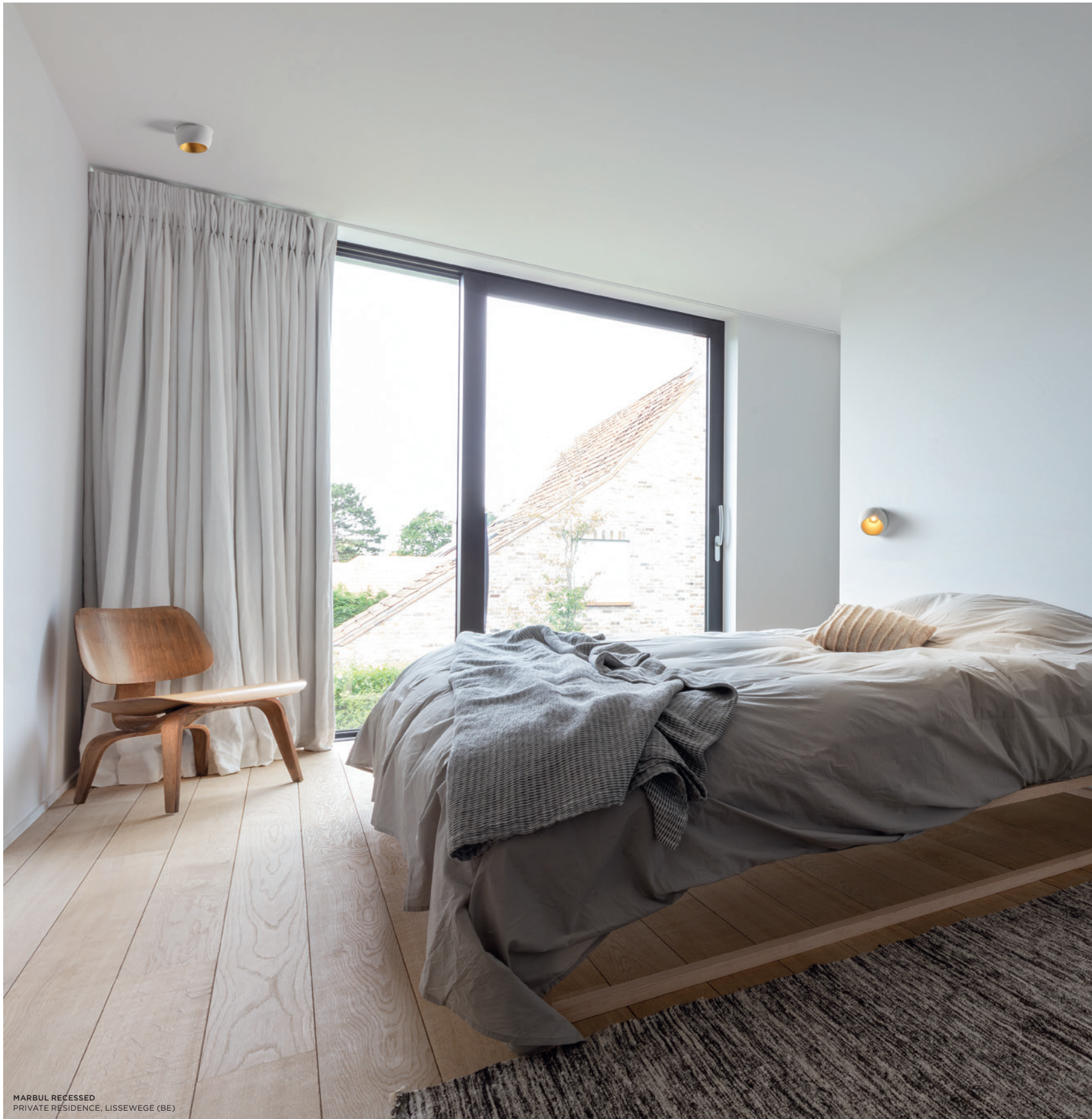
MARBUL RECESSED PRIVATE RESIDENCE, LISSEWEGE (BE)