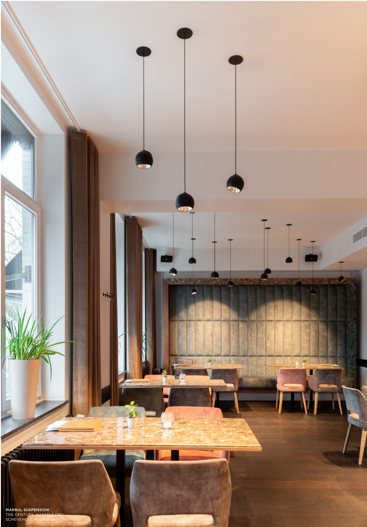
MARBUL SUSPENSION THE CENTURY HASSELT (BE) SCHEVENEL'S INTERIEUR